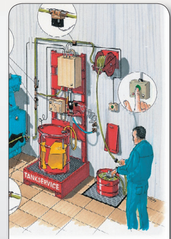
This example shows the combination of two dispenses, one manually operated according to the requirement of the worker, the second one automatically operated directly into the machinery.

Same as art. no. 8457, but installed in a metal cabinet.